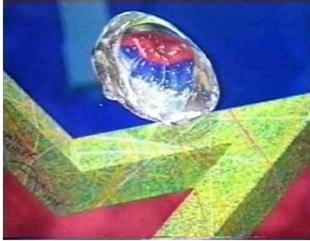
Fig. 7. A globule of water next to the Cosmic Dancer sculpture on the Mir space station. 1993

Concerning their suitability for integration in crewed environments such as space stations and future interplanetary spacecraft, the material of the Cosmic Stones is non-flammable and durable. The edges of stones are blunt and rounded.