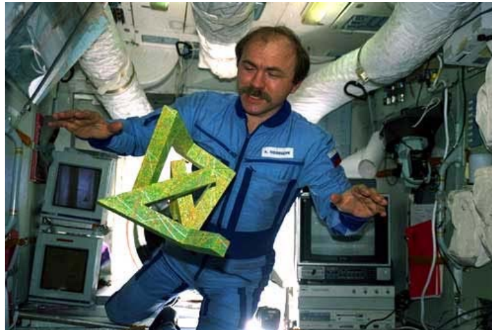
Fig. 9. Cosmonaut Alexander Polischuk and the Cosmic Dancer on the Mir space station, 1993

“One can see in this figure any being one wants. Therefore it is interesting to enjoy looking at it and to hold it in ones hands. When holding it in ones hands, one caresses it and feels a cozy feeling, as if one would hold a living being. We think that such art works are not only important to the artists who send them into space but also for us cosmonauts who simply feel the presence of a little artwork as comfortable.” [11]