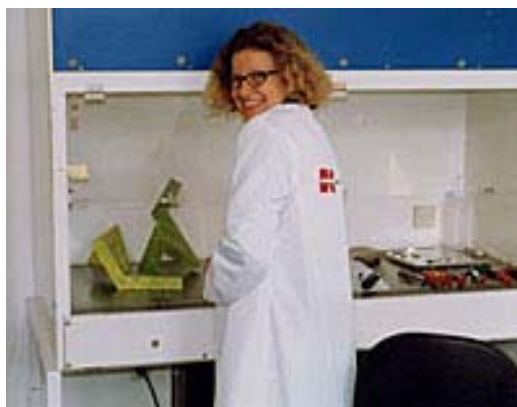
Fig. 8. Preparation of the Cosmic Dancer sculpture at Kayser-Threde GmbH, Munich, Germany

The acrylic paints which will be used are Lascaux Artists Paints which have been tested by the Russian space agency for their approved use in the closed environment of a crewed space habitat (Mir space station). These paints exhibited no toxic out gassing or other issues. Lascaux paints were used for the Cosmic Dancer sculpture [10] flown to the Mir in 1993 and on the twenty artworks selected for the Ars Ad Astra project sent to Mir as a part of the ESA Euromir95 mission.