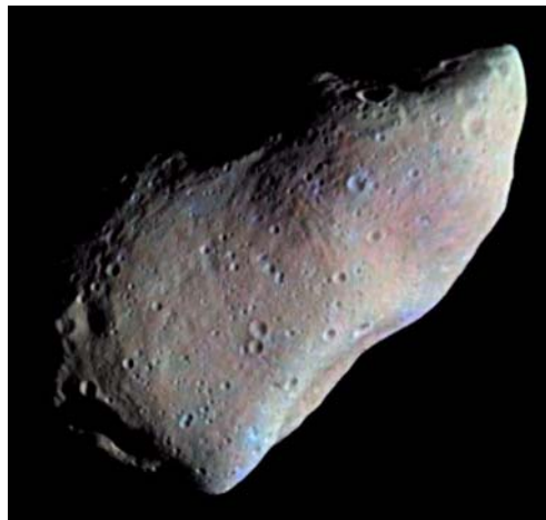
Fig. 6. This picture of asteroid 951 Gaspra was obtained by the Galileo spacecraft during its approach to the asteroid on 29 October, 1991.

Other than the obvious weight and logistical characteristics of the Cosmic Stones selected for spaceflight, there appears to be no technical obstacles to their eventual manifestations on spacecraft, space habitats or placement on the surfaces of other planetary bodies.