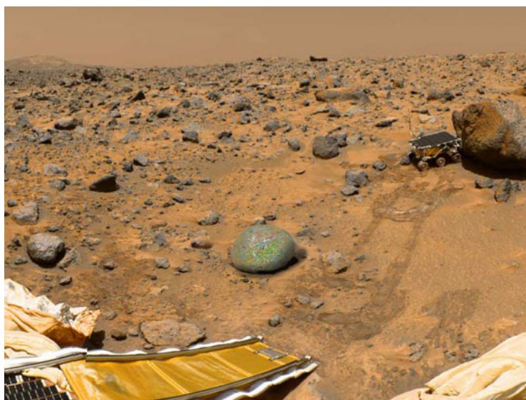
Fig. 11. Artist's Conception of a Cosmic Stone placed on Mars