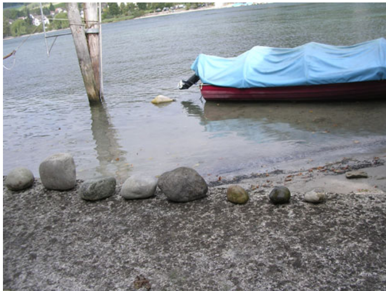
Fig. 4. Stones found by my home in Stein am Rhein

The stones I am using in the Cosmic Stones project obtained their final form through their journey from the Swiss mountains to the banks of the Rhine river next to where I live. They arrive serendipitously in “Stein am Rhein” where they I find them and prepare them for their ultimate journey into the cosmos.