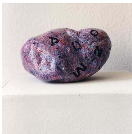
Fig. 2. Philosopher's Stone , 1994 Acrylic on Stone ca. 8 x 20 x 6 cm

My intent to send such painted stones into space adds a new dimension to these works and they now become Cosmic Stones by applying the "magic" of space technology.