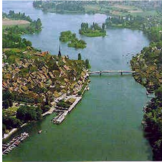
Fig. 3. Stein am Rhein Where the Lake of Constance (Bodensee) becomes the Rhine River

The idea of making Cosmic Stones is also directly related to my recent move to the historic Swiss town of “Stein am Rhein” translated into English as: “Stone on the Rhine”. The local people refer to the village simply as “Stein”. The local inhabitants are called “ Steiners ”. Stein am Rhein is located at the beginning of the Rhine river as it flows from the Lake of Constance (Bodensee) on its way to the North Sea.