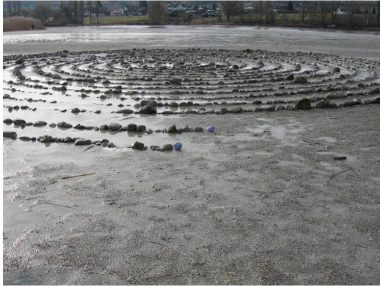
Fig. 5. Stone spiral with two Cosmic Stones , 2006 Stein am Rhein

Recently it was pointed out to me that a source of my name “Arthur” comes from the Irish Gaelic word meaning "stone" [1].